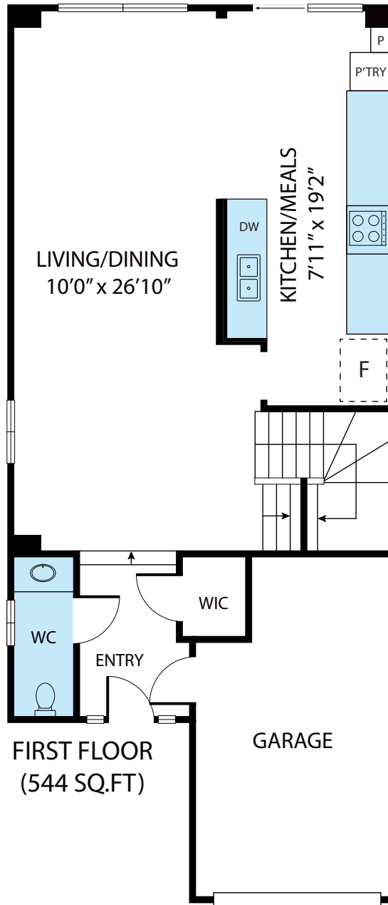
FIRST FLOOR (544 SQ.FT)